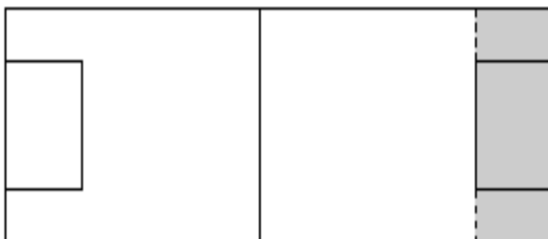
Attacking team offside only in shaded area

With Under 7, Under 8 and Under 9 games the Offside Law is only applied within 9 metres of the attacking team's goal line.